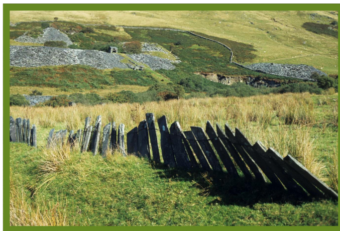
15B Incline and Winding House

The ACH project provides an opportunity for current and former members of the local community to share their own local heritage and knowledge of this landscape and to have a voice in shaping how World Heritage status might impact on it.